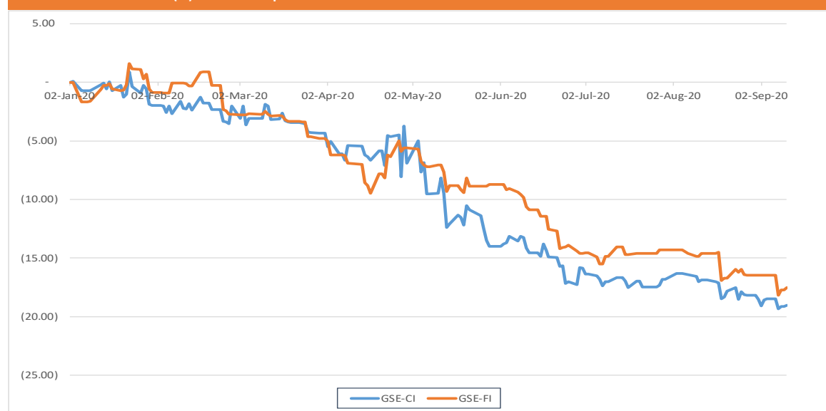
Index YTD Performance (%) as at 11 th September 2020